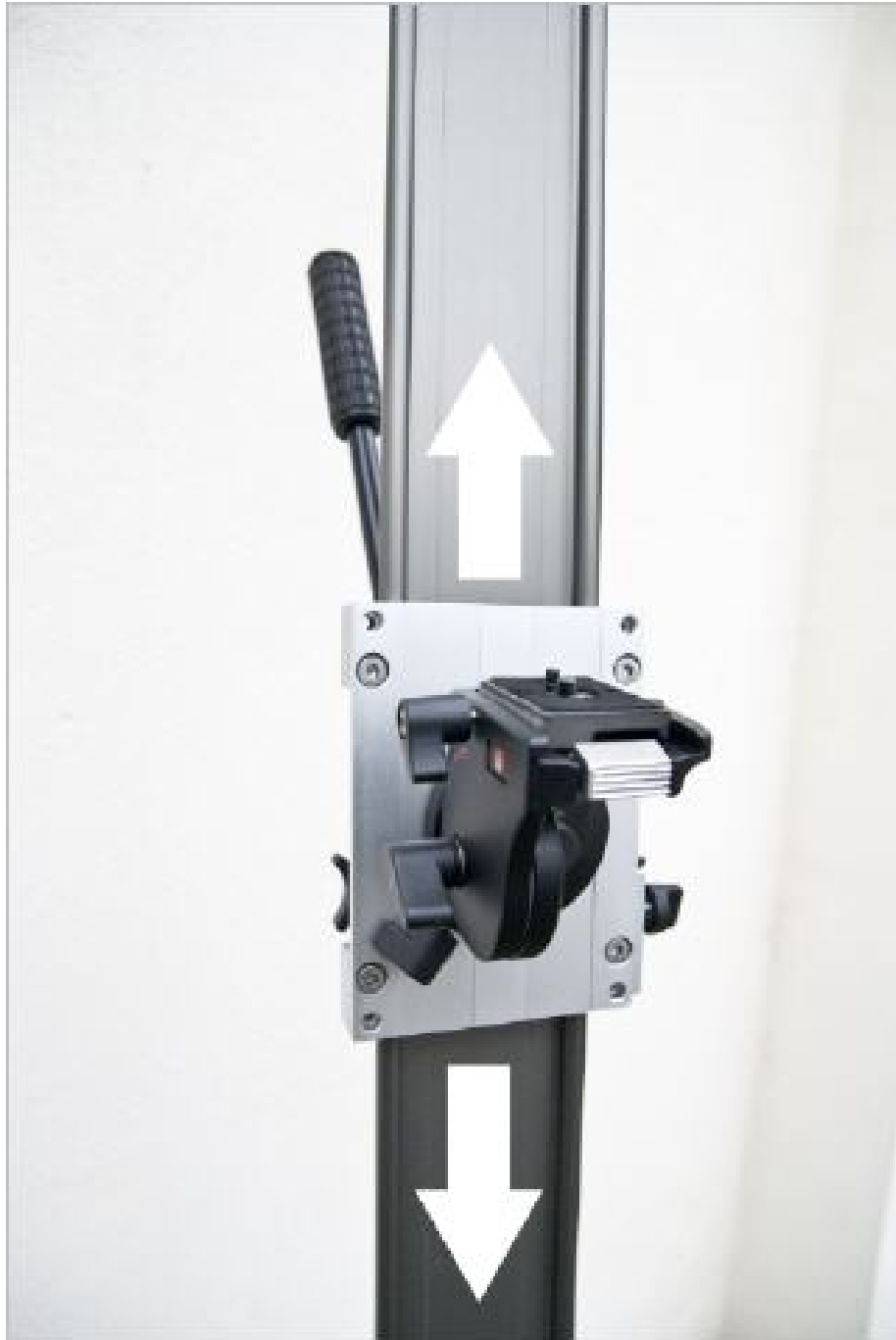
Up and down (with tripod head or "ballpoint"): You can drive the camera up and down by tilting your Camera-Slider-System by 90°